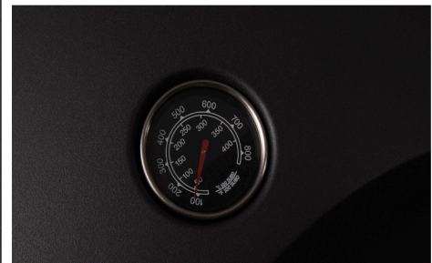
MORSØ FORNO GAS GRANDE